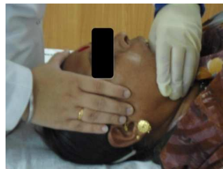
Fig 5: mobilisation for lateral glide

Participants received 18 sessions (6 days per week) of 45-60 minutes over the period of 3 weeks. This study was approved by the institutional ethical committee, Pravara institute of medical science ref.no PIMS/CPT/2012/1242/2. All participants were free to withdraw from the study at any time.