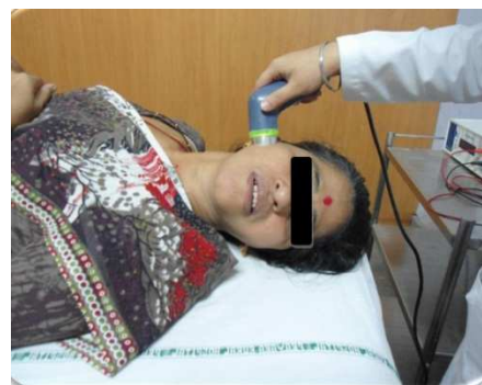
Fig 1: Ultrasound

Participants were divided into 2 groups experimental and control group each having 25 participants. Both the groups received therapeutic ultrasound of 1 MHz frequency and continuous mode set at 1.25 W/cm, for 3 minutes was applied. [16] (fig 1).