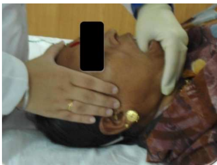
Fig 4: mobilisation for distraction and translation

Mobilization – distraction, translation and lateral glide was given for one session with 3 repetitions for 30 seconds. [22] (fig 4,5). Grade 1 and 2 was given to reduce the pain. Once the pain was reduced grade 3 and 4 is given to increase the range of motion. [19].